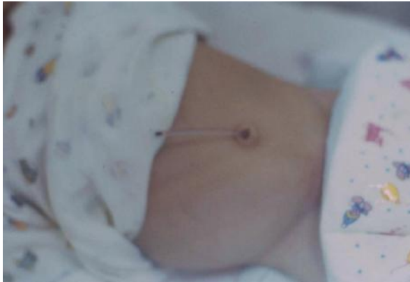
Fig 1: Peritoneal catheter extrusion through umbilicus

small umbilical hernia since birth time. On admission she had low grade fever and CSF leakage from the extruded peritoneal catheter. CSF culture taken from pump was positive for Klebsiella . Abdominal sonography was normal. She was managed with shunt removal, 3 week antibiotic therapy and delayed VP shunt. She died 2 months later with sudden stridor and respiratory distress due to probably Chiari type 2.