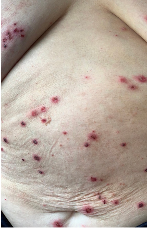
Fig. 1 Varicelliform eruption with multiple umbilicated vesicles in a patient who tested positive for IgM-SARS-CoV-2. SARS-CoV-2, severe acute respiratory syndrome coronavirus 2.