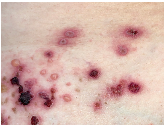
Fig. 2 Varicelliform vesicles and flaccid bullae on normal skin typical for PV in a patient who tested positive for IgM-SARS-CoV-2. (Same patient as in Figure 1.) SARS-CoV-2, severe acute respiratory syndrome coronavirus 2.