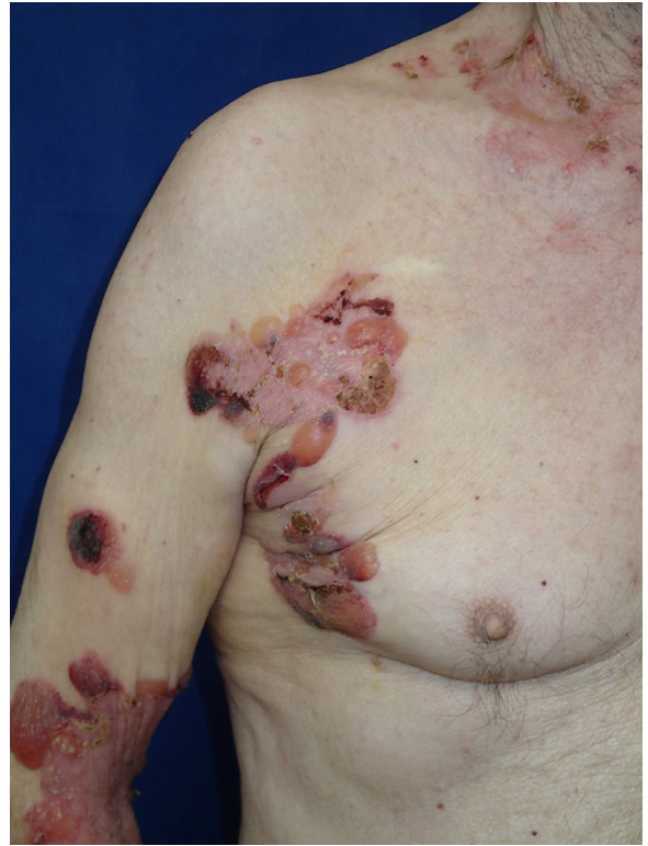
Fig. 3 Tense blisters and multiple erosions in a patient with BP who was the contact person to an IgM-SARS-CoV-2 positive relative. BP, bullous pemphigoid; SARS-CoV-2, severe acute respiratory syndrome coronavirus 2.

At the Department of Dermatology, Medical University-Sofia, Bulgaria, for the period of the pandemic, we observed only 1 BP patient, suspected of having been in contact with a family member affected by affected COVID-19. This was a 72-year-old man with newly diagnosed BP, having typical clinical characteristics (Figure 3) that followed pembrolizumab administration for metastatic melanoma. He was living in close contact with his daughter who was IgM-SARS-CoV-2 positive. The patient presented in good general condition, with a normal chest x-ray and negative SARS-