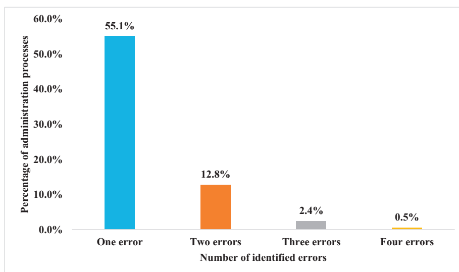
Figure 1: Distributions of the opportunity of errors based on the number of medication administration errors (n = 1012).