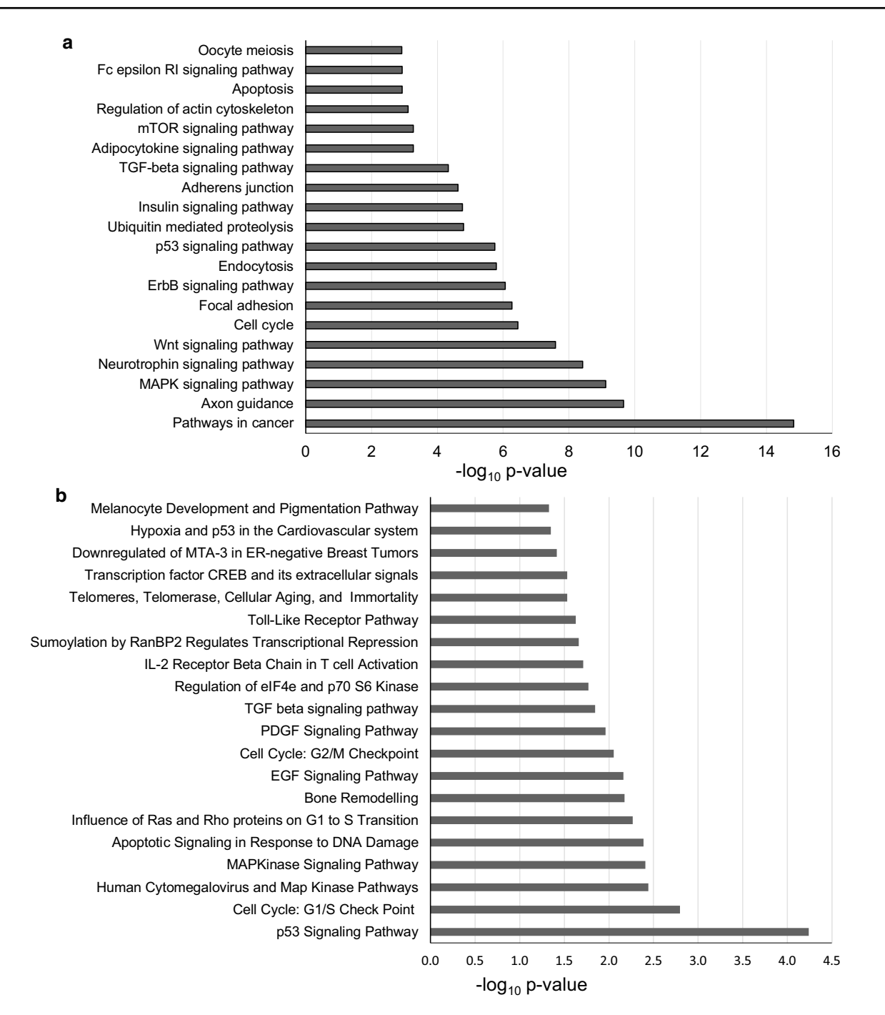
Fig. 2 Biological pathways potentially governed by X-linked micro-RNAs. The whole targetome (predicted and validated) of X-linked microRNAs was analyzed by the program DAVID. a Top-20- p values significantly enriched pathways according to KEGG (full list as Sup-