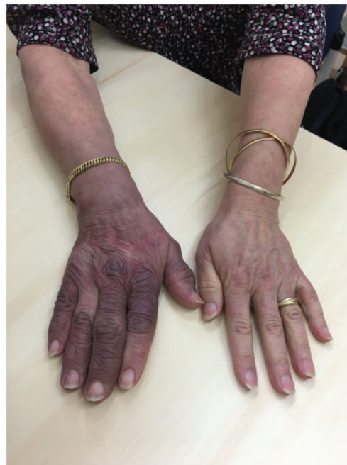
Fig. 1 Hypertrophy of the right hand with skin atrophy, red-blue discoloration and tenosynovitis