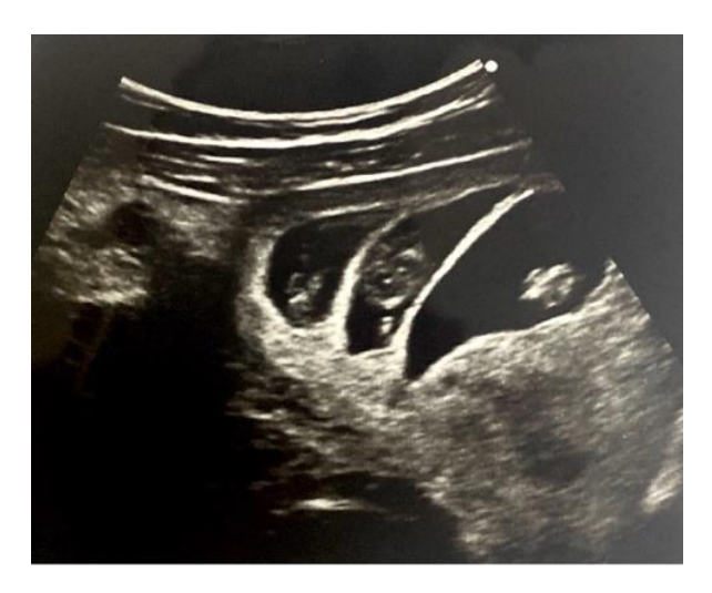
Figure 1. Transabdominal scan at 9 weeks of pregnancy confirms a trichorionic triamniotic (TCTA) pregnancy. Clear visualization of the two lambda signs and thick intertwin membranes, composed of a central layer of chorionic tissue sandwiched between two layers of amnion, therefore multi-layered, more echogenic.

In early pregnancy, at the 9 weeks of gestation, after ET the ultrasound scan demonstrated a triplet triamniotic viable intrauterine pregnancy was diagnosed (Figure 1) along with ovarian hyperstimulation syndrome. She was hemodynamically stable, however at 10 weeks gestational age she complained of lower abdominal pain.