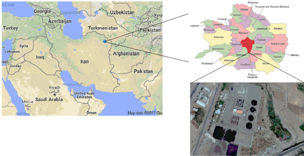
Fig. 2. Location of wastewater treatment plant.