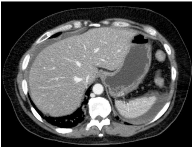
Figure 1 Abdominal computed tomography (CT) scan (axial) with intravenous contrast demonstrating an important hemoperitoneum with densities around the spleen and the right lobe of the liver.

It was impossible to obtain the opinion of either a vascular surgeon or an interventional radiologist for this acute intraabdominal hemorrhage, and it was indispensable to shift the patient to the operating room for an emergency surgery to control the source of bleeding. An emergency exploratory laparotomy was performed under general anesthesia. This Surgical exploration showed an important hemoperitoneum and a large periduodenal hematoma which was extending into the retroperitoneal space. Two liters of blood were evacuated from the free peritoneal cavity. Besides, we noted a significant bleeding from the right gastroepiploic artery, with no obvious aneurysm, that was successfully ligated. Further exploration identified no additional bleeding, and the retroperitoneal hematoma was respected. The patient recovered well without postoperative complications and she was discharged 5 days after the surgery.