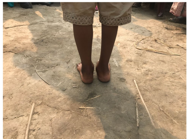
Photos. 1-3 Two-year post-operative status after right PMR with TATT in 5-year-old boy