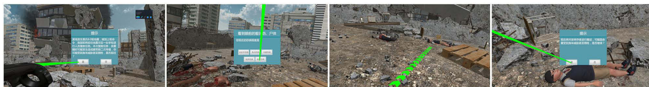
Figure 2 Examples of tracking and interactive devices.