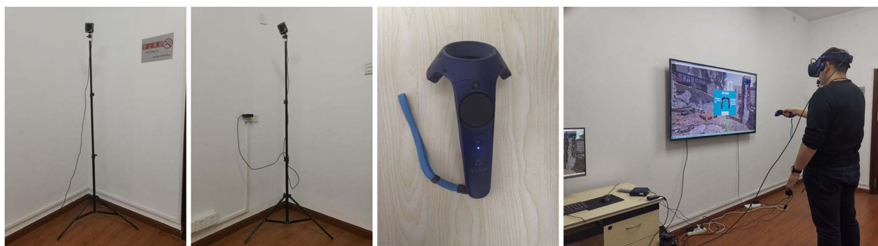
Figure 3 Flow Diagram of Experiment.

recorded (physiological indicators). Then, the participants were randomly assigned to 1 of 5 virtual courage scenarios, and each scenario's physiological indicators were recorded (Figure 3).