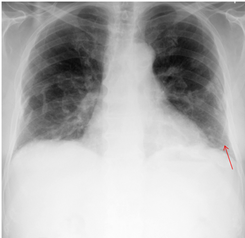
Fig. 2. Anteroposterior view of chest X-ray shows basal atelectasis and multiple bilateral calcified pleural plaques (red arrow) consistent with prior asbestos exposure. (For interpretation of the references to color in this figure legend, the reader is referred to the web version of this article).

rifabutin 300 mg once daily. The rifabutin was discontinued 3 weeks into therapy due to neutropenia and transaminitis. His bursitis resolved after a 12-month course of ethambutol and clarithromycin. Repeat sputum cultures were not obtained after completion of therapy.