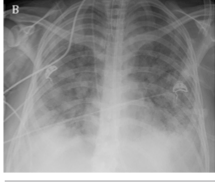
Figure 1. A) The patient's portable chest radiograph on admission showing subtle prominence of the interstitial markings and multiple ill-defined nodular opacities. B) Portable chest radiograph taken following endotracheal intubation demonstrating interval development of diffuse bilateral interstitial and alveolar opacities as well as diffuse granular opacity and possible right pleural effusion. C) Ultrasonographic image of the liver obtained at the bedside showing a large hepatic mass-like lesion demarcated by the blue calipers with both cystic (red stars) and solid (yellow stars) components.