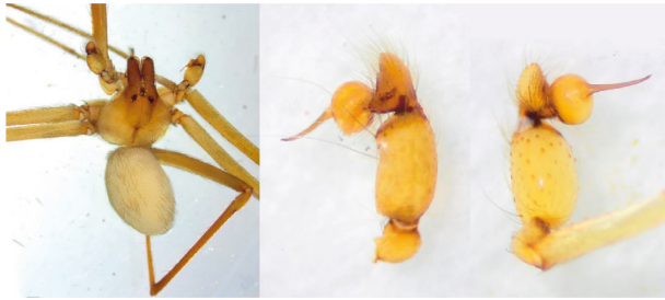
FIGURE 3: Loxosceles rufescens spider, collected in Bashagard, Hormozgan Province, south of Iran. (a) Dorsal view and (b) Palpa.

Distribution: Greece (Crete), Cyprus, Egypt, Israel, Lebanon, Syria, Lebanon, Syria, Yemen (Socotra), Saudi Arabia, United Arab Emirates, and Iran. Iranian provinces: Alborz, East Azerbaijan, Fars, Hormozgan, Isfahan, Kerman, Kurdistan, Mazandaran, Semnan, and Tehran.