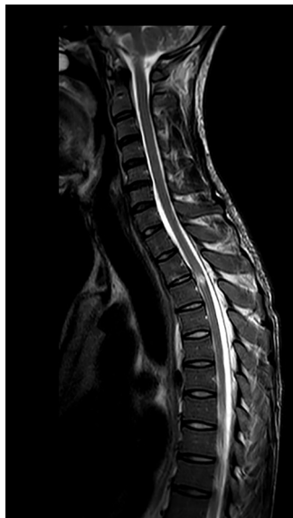
Figure 2. T2-weighted MRI a central intramedullary high signal lesion of the spinal cord at the level of T2–T3. MRI, magnetic resonance imaging.

pharyngo-oesophageal injuries. T2-weighted magnetic resonance imaging (MRI) of the spine revealed a central intramedullary high signal lesion of the spinal cord at the T2–T3 level as the cause of his acute paraplegia (Figure 2).