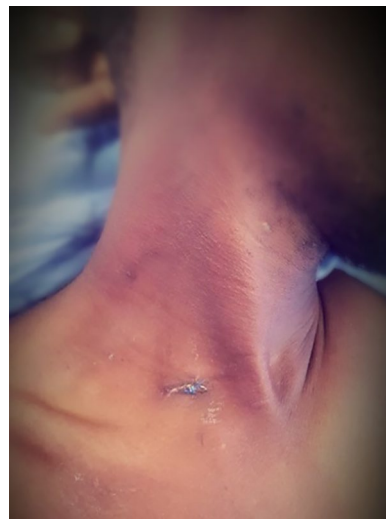
Figure 1. Clinical photograph depicting a single stab wound in zone 1 of the right anterior triangle.

A 34-year-old male patient was brought to our emergency department by his neighbor after sustaining a single stab wound to the neck and finding himself unable to walk. Physical examination found him fully conscious, hemodynamically stable and without any neck restraint. A single right-sided stab wound was noted in the lower anterior triangle of the neck (Figure 1), and air entry was