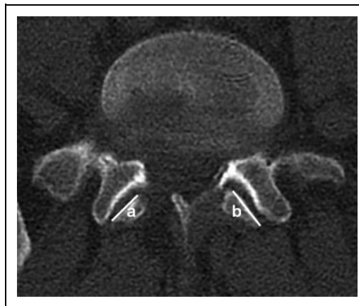
Figure 1. The extent of resection determined by comparing (a) the width of the resected facet to the (b) width of the contralateral facet at the level of decompression expressed as a percentage (width of the resected facet/width of the contralateral facet; a/b ).

Statistical analysis was carried out with IBM SPSS software version 21.0. Statistical significance was set at P < .01 .