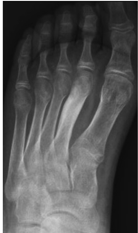
Fig. 1 – Plain radiograph of the left foot of a 14-year-old boy showing cortical thickening of the second metatarsal bone. The patient was finally diagnosed with osteoid osteoma of the distal part of the second metatarsal bone

lesion, osteoid osteoma was proposed as the most likely diagnosis. The bone lesion was surgically removed and sent for pathologic examination which confirmed the diagnosis of osteoid osteoma. Four weeks after the surgery the patient came for another visit and reported substantial relief of his pain.