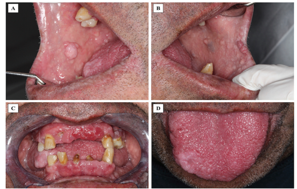
Fig. 2 : A,B. Multiple sessile pink papules with smooth surface on the right and left buccal mucosa respectively. C and D. Cobblestone appearance of multiple confluent red papules, of different size and shape on the upper, lower attached gingiva and dorsum of the tongue respectively.