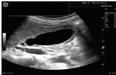
FIGURE 1: Gallbladder ultrasound showing a distended gallbladder, some pericholecystic fluid, and no gallstones.

No abnormalities were detected on chest X-ray. The blood cultures grew Salmonella Typhi with resistance to ciprofloxacin and sensitivity to amoxicillin, ceftriaxone, and cotrimoxazole. Investigations for malaria, HIV, dengue, and viral hepatitis were all negative. Stool cultures were negative.