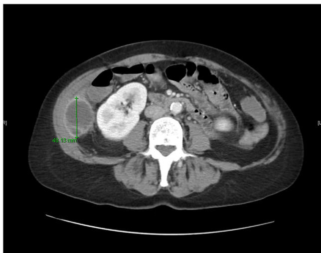
Fig. 1. The CT of the abdomen and pelvis with contrast showed a 12.4 \times 4.8 \times 3.6 cm fluid collection within the right lateral abdominal wall with 2 radiopaque structures resembling gallstones.