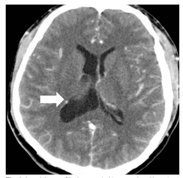
Fig. 1. An axial scan of brain computed tomography with contrast enhancement demonstrates asymmetric dilated right lateral ventricle (white arrow).

The patient was admitted to neurology department with the initial diagnosis of bacterial menigoencephalitis and treated with empirical antibiotics (3rd generation cephalosporin and vancomycin) in the intensive care unit (ICU). Mechanical ven-