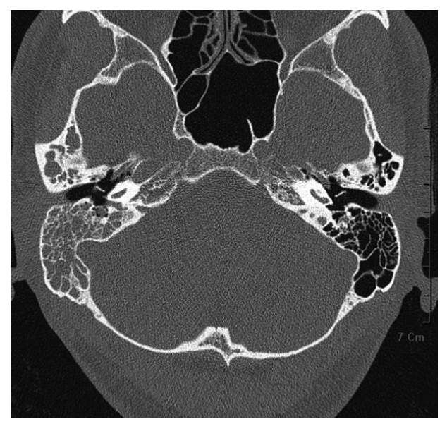
Fig. 3. Temporal bone computed tomography image on the 17th day of hospitalization. All air cells in right temporal bone were filled with soft tissue. Aeration of the tympanic cavity was fair by virtue of a ventilation tube.

the facial canal were intact. Localized destruction of attic and tegmen were accompanied with partial exposure of the dura mater that covers the floor of the middle cranial fossa. Tegmen defect might be a direct propagation route of inflammation causing brain abscess. However, considering the location of the abscess, the possibility of hematogenous propagation could not be excluded.