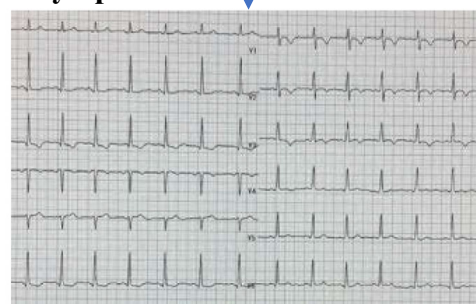
Figure. Electrocardiogram changes at the annual health checkup and symptoms. ECG: 12-lead electrocardiogram

tive. Loxoprofen 60 mg thrice daily was prescribed. Her chest pain was relieved one week later. One month later, her ECG findings returned to normal. According to the proposed Bozkurt’s criteria (5), probable acute myocarditis due to COVID-19 vaccination was diagnosed. Since myocarditis can be fatal and most reported COVID-19 vaccination-related myocarditis cases have been seen in men (2-4), myocarditis due to COVID-19 vaccination in women is likely to be overlooked. Chest symptoms after COVID-19 vaccination in women should therefore be carefully monitored. Further epidemiological research on the cardiac side effects of COVID-19 vaccination in women seems necessary.