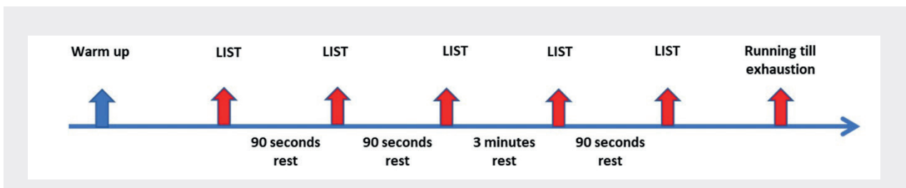
Figure 1. An overview of the exhausting exercise protocol. LIST: Loughborough Intermittent Shuttle test.

Blood samples were collected by an expert in laboratory science from the left arm (in sitting position) immediately after the exhaustive exercise session and 24 hours after the recovery protocol before and after 4 weeks. Blood samples were then centrifuged at 3000 rpm for 20 minutes and then stored at -80 °. Blood samples were collected by an expert in laboratory science from the left arm (in sitting position) immediately after the exhaustive exercise session and 24 hours after the recovery protocol before