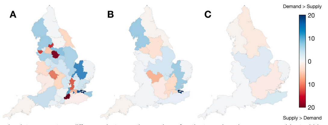
Figure 3 The absolute percentage difference between the number of patients undergoing surgery resident within a surgical community (demand) and the number of procedures performed by hospitals within the community (supply) for configurations of 45 (panel A), 16 (panel B) and 7 (panel C) surgical communities. Areas in blue represent those surgical communities where procedures performed on patients outnumber those performed by the local providers.

Central management of pooled waiting-lists across an increased number of both NHS and non-NHS providers offers an opportunity for greater collaboration between surgical centres and a better distribution of workload. It would provide enhanced system resilience in the context of future COVID-19 outbreaks to continue planned surgery in dedicated clean sites.<sup>8</sup> <sup>26</sup> <sup>27</sup> The scheme may have additional benefits including increased patient choice, greater workforce flexibility and maximisation of teams across areas, with increasing efficiency. There is a paucity of high-quality data on the effects of pooled waiting-lists.<sup>28</sup> Some evidence for their potential success has come from smaller, single-site initiatives piloting internal pooling of cases distributed to consultants in the same department. <sup>29 30 30</sup> Surgical pooling has been used successfully in crises to achieve waiting-list targets with work done by non-consultant grade surgeons and cases shifted to the private sector. Surgical pooling has also