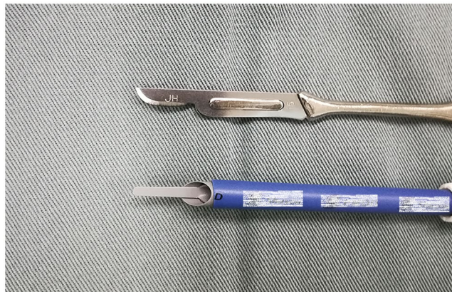
Figure 1. Schemas of the cold knife (up) and electrosurgical instrument (down). The trademarks have been marked.

clinicopathological characteristics and postoperative complications between various conization and suture methods in a large cohort of patients from a single study center.