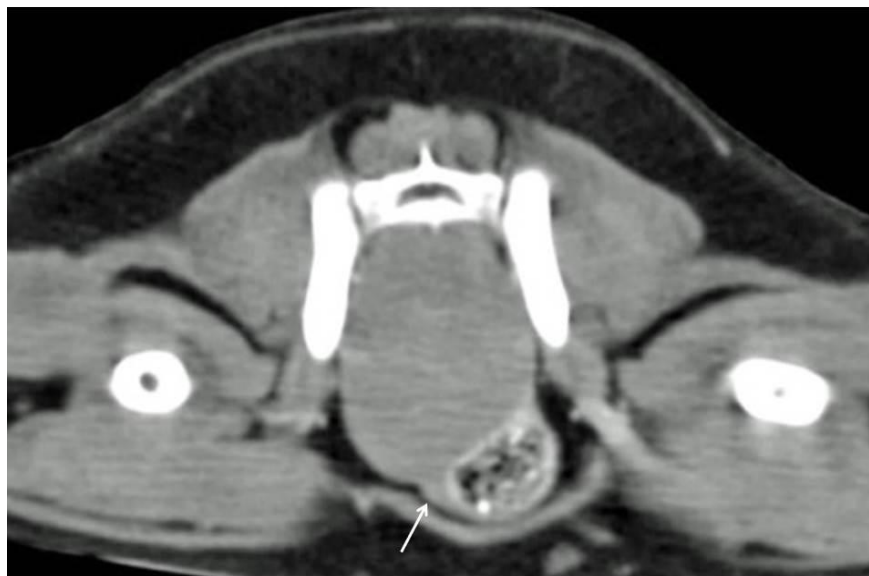
Figure 1. Tomographic appearance of an intra-pelvic mass. The colon is displaced ventrolaterally. The urethra is highlighted by the white arrow.

Computed tomography revealed the presence of a single and 2 adjacent masses in 6 out of 7 (86%) ( n 3–5, 9–11) and 1 out of 7 cases (14%) ( n 8), respectively. The masses appeared well defined and homogeneous, with mild contrast enhancement in all cases. Colonic and rectal displacement, and urethral compression were always present (Figure 1).