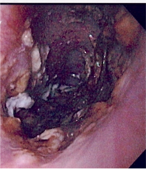
Figure 2 Esophageal candidiasis.

clinical criteria may be accepted as a basis for initiating antifungal therapy in high risk patients. The differential diagnosis of EC must include gastroesophageal reflux disease (GERD), idiopathic HIV-ulcers, and viral esophagitis due to either cytomegalovirus or herpes simplex virus.<sup>1,20,21</sup>