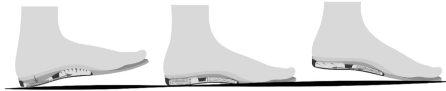
FIGURE 2: Mechanism of the double air-cushioned shoe during walking. During heel strike, midstance, and toe off phases, air moves from the heel air bag to the arch air bag, providing dynamic support.