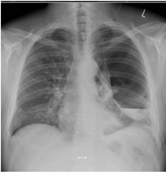
Fig. 1. PA chest radiograph showing a left sided pneumothorax and empyema with chest drain in situ.

pneumothorax locules/complex bullous lung disease compressing the upper lobe. The right lung was normal. He was commenced on broad spectrum antibiotics – Flucloxacillin, Vancomycin, and Piperacillin/Tazobactam – as per microbiology advice with minimal improvement (Fig. 2).