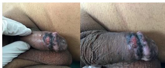
Figure 1. Pigmented, ulcerated lesion on the foreskin and the glans penis.

Most authors describe melanoma of the penis and glans penis using the three-stage system. Stage A includes localised disease in the penis, regardless of the depth of invasion; stage B includes melanoma involving the inguinal lymph nodes; and stage C refers to disseminated metastatic disease. Other authors use the AJCC TNM Staging System [9], which relies on the Breslow depth of invasion, excluding only melanoma of the urethra [3, 10]. Treatment is surgical and includes conservative procedures for localised disease and radical surgeries for locally advanced cases. Advanced cases, however, can also involve surgery to prepare for palliative care and systemic chemotherapy.