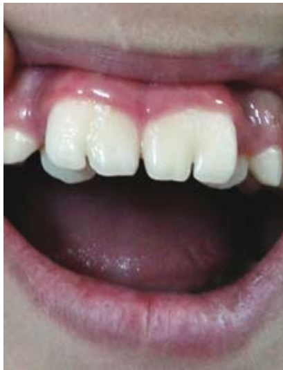
Fig. 1. Clinical view of bilateral geminated permanent maxillary central incisors with deep notches.

A nine-year-old boy was referred to the Department of Oral and Maxillofacial Radiology for the evaluation of enlarged permanent maxillary central incisors, which caused aesthetic and chewing problems (Fig. 1). There was neither remarkable medical history nor family history of dental anomalies.