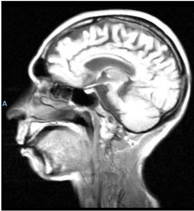
Figure 2 MRI showed increased density in posterior protuberance and mesencephalon suggestive of Wilson disease.

Psychiatric symptoms were first resolved in the first 3 weeks of treatment with progressive resolution of the motor symptoms during the next 12 months (and without concomitant antipsychotic drugs) that required antiparkinsonian treatment with L-3,4-dihydroxyphenylalanine 100/carbidopa 25. The patient was discharged after 2 months of hospitalisation and referred to the neurological outpatient department. Eighteen months later there remained an ataxic march and ceruloplasmin levels normalised. No renal or hepatic damage was detected.