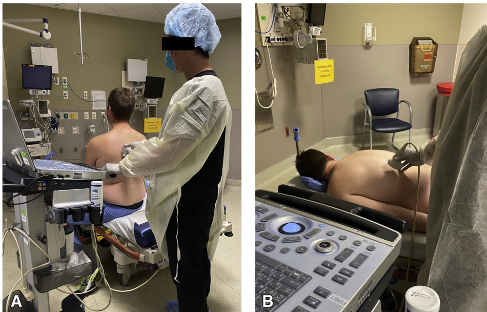
Figure 2. Lung point-of-care ultrasound positioning and image acquisition for scanning patients with suspected coronavirus disease (COVID)-19. (A) In a patient positioned upright, the operator and machine should be positioned behind the patient to minimize exposure risk. (B) Safe positioning can be similarly achieved in a prone patient.

Lung POCUS findings most commonly associated with COVID-19 include B-lines, which can be isolated or diffuse, an irregular pleural line, sub-pleural consolidations, and peri-pleural edema (Figure 1) (23,24). Findings are typically bilateral and most prominent in the posterior and lateral lung zones inferiorly (13,23–26). Pleural effusions are rarely seen (27). COVID-19 pathologic changes tend to be particularly amenable to assessment by lung POCUS given their peripheral and peri-pleural