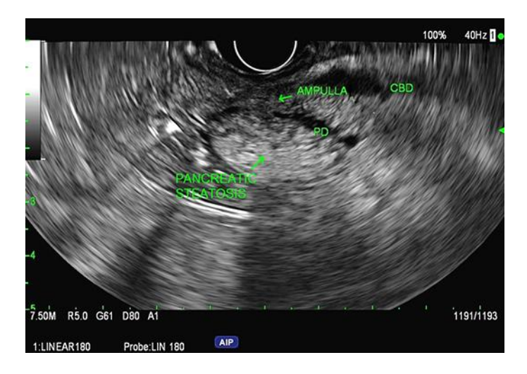
Fig. 1. Example of pancreatic steatosis on endoscopic ultrasonography in patient 1. Patients 2 and 3 were found to have similar findings.