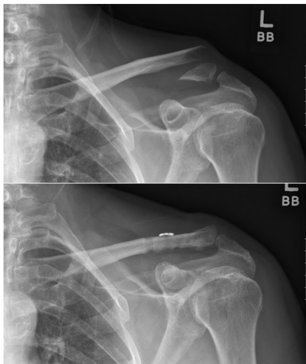
Figure 3. Preoperative and postoperative radiographs. All patients achieved radiographic union.

the time of the final in-office visit and at telephone follow-up (mean UCLA score at final in-office visit: 30.81, mean ASES score at final in-office visit, 87.15; P > .05 ).