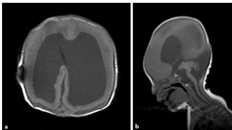
Fig. 1. Cranial MRI (T1WI) of the patient in this study at 22 days of age. a Agyria. b Lissencephaly of the brain surface, hydrocephalus, cerebellar and brainstem hypoplasia, and an enlargement of the fourth ventricle are evident. Each lesion is indicated by an arrow. (1) Agyria and lissencephaly of the brain surface, (2) hydrocephalus, (3) cerebellar hypoplasia, (4) enlargement of the fourth ventricle, and (5) brainstem hypoplasia.