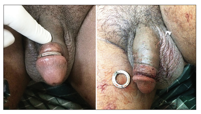
Figure 4: Second patient with the ring. Note intact skin after removal

In our experience, string method with aspiration of blood from corpora is better than the use of various cutting devices. These two methods are particularly useful together, as the string technique provides sequential compression and aspiration allows the congested blood a method of exit. Instead of glanular puncture described previously, we did bilateral corporal aspiration, preventing the possibility of formation of a corporoglanular shunt leading to erectile dysfunction in the future. We successfully removed various objects by this method. With rapid intervention and removal of the foreign body, most patients do extremely well and need no further intervention. The outcome, even