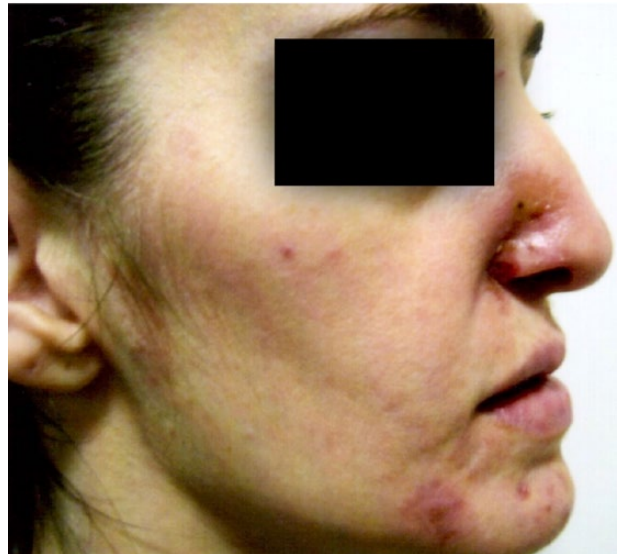
Figure 2. Right side view of the face of the patient; ulcerations and collapse of the ala nasi are clearly visible.

Dermatological examination diagnosed an allergy to nickel, a material found in the metal plates positioned during surgery 8 years before (Figure 1); plates and wires were therefore removed in 2005. Instrumental tests, including skin biopsy, were negative for human herpes virus, autoimmune vascular and connective diseases, leprosy, granulomatosis and skin cancer. No clinically evident neurologic deficits were reported during neurological examination. In 2008, a psychiatrist also diagnosed a severe reactive chronic depressive syndrome caused by the social difficulties following the