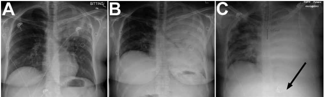
Figure 1. Chest radiograph at various stages of Blastomyces gilchristii infection in a 27-year-old woman, Ontario, Canada. A) Day 0: posterior–anterior (PA) chest radiograph at initial emergency department examination. Discrete confluent left upper lobe consolidation with air bronchograms are visible. B) Day 5, 15:10: PA chest radiograph demonstrating complete confluent opacification of the left hemithorax with extensive air bronchograms. C) Day 6, 23:30: PA chest radiograph postintubation with confluent left lung consolidation and new right patchy airspace opacification. Arrow indicates the correct placement of a nasogastric tube.

transcribed spacer 2 (ITS2) region was amplified by PCR using the primers described in White et al. (5), and the resulting product was sequenced. Sequences were analyzed, and the single nucleotide polymorphism in ITS2 at position 19 (used for differentiation of B. dermatitidis from B. gilchristii ) was noted (3). The sequence of 13BL347 ITS2 possessed a cytosine at position 19, which is diagnostic for B. gilchristii , whereas thymine at that position is conserved in B. dermatitidis . By using a multiple sequence alignment tool, we aligned the 13BL347 ITS2 sequence to sequences of several well-characterized representative sequences