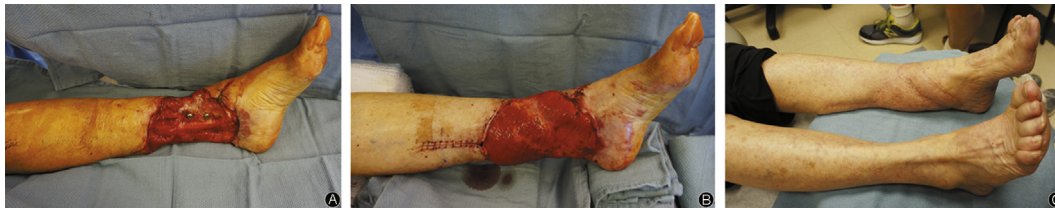
Fig. 2. After nailing there is a complex soft tissue defect over the distal tibia with exposed hardware (A). This is only suitable for coverage with free tissue transfer. Here a free muscle flap was used (B) and the surface subsequently covered with a split skin graft. A grade IIIB injury. The final result is excellent (C).