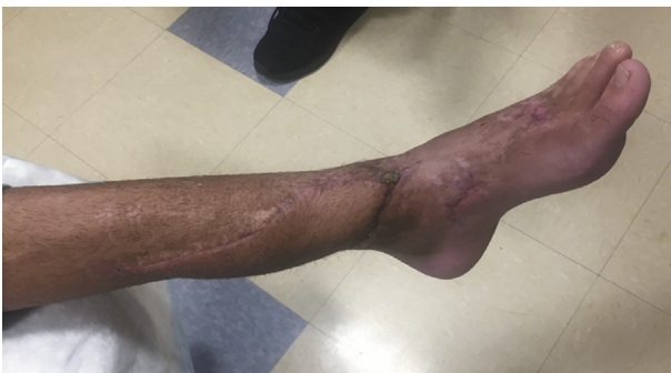
Fig. 3. The final result after a free fasciocutaneous (lateral thigh) flap to the distal leg for a grade IIIB injury.