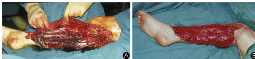
Fig. 4. Initial assessment of major de-gloving 3C injury (A) treated by single stage debridement, revascularisation, internal fixation and free flap cover (B) with a latissimus dorsi flap incorporating the vascular branch to serratus anterior so the limb could be revascularized and the flap vascularized with the same micro vascular anastomosis.