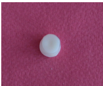
Fig. 2. Fabricated zirconia CAD/CAM coping.

In order to eliminate the effect of impression and pouring variations, the metallic die was used as the definitive die. The die was sprayed with scan spray and scanned using a 3D-laser scanner (3ShapeD810; 3Shape, Copenhagen K, Denmark). The data were transferred to CAD software (3Shape's CAD Design software; 3Shape, Copenhagen K, Denmark) in which the copings were designed with a uniform thickness of 0.5 mm around, considering 30 \mu m spacer, and 1 mm short of the margin. In the occlusal surface a depression was designed to accommodate the tip of the holding device (Fig. 2). Thirty zirconia copings were milled from pre-sintered Y-TZP blanks (IPS e.max ZirCAD, Ivoclar Vivadent) in a milling machine (inLab MC XL, Sirona) in a