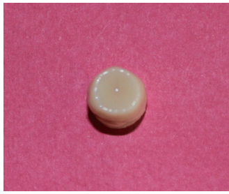
Fig. 5. Fabricated zirconia CAD/CAM crown.

ensure the same seating of them as copings on the die (Fig. 5).