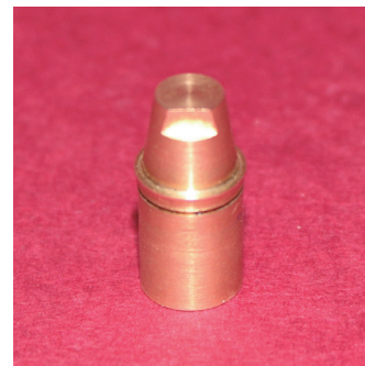
Fig. 1. Brass master die.

Ceramic materials investigated in this study were displayed in Table 1. A brass master die was machined to approximate dimension of a prepared molar for an all ceramic restoration with 7 mm height, 6 degree of occlusal convergence and a 90 degree shoulder of 1 mm wide finish line (Fig. 1). Preparation of master die was free of any irregular-