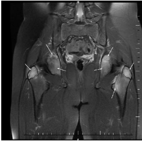
Fig. 2: 3 months later: coronal fat suppressed T2 weighted image shows edema signal at bilateral acetabulum, major trochanter and left minor trochanter