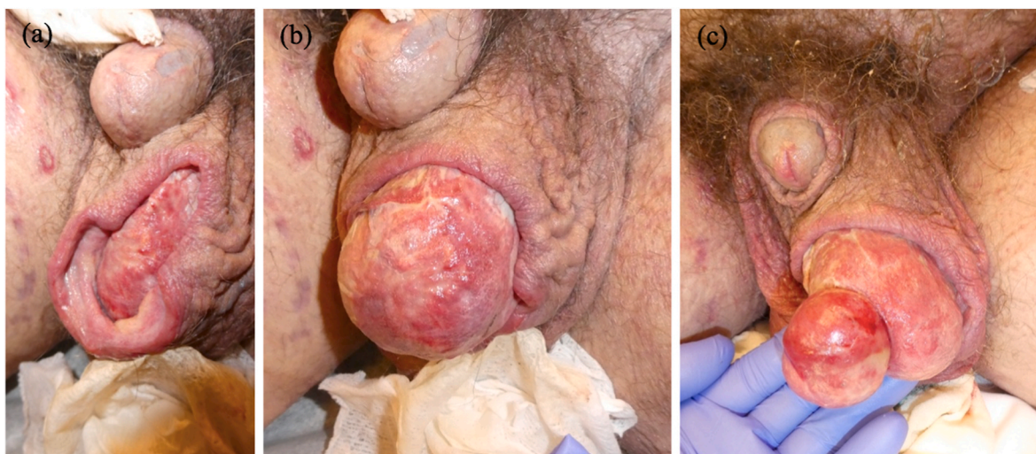
Fig. 1. Scrotal Wound. (a) (b) Images show the single left hemiscrotal wound with prolapse of the scrotal contents. (c) Six weeks later, there is now exposure of the testicle.