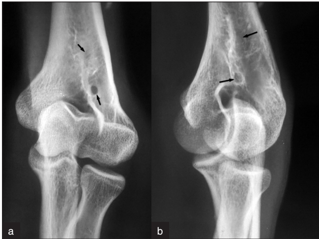
Figure 1: (a) Anteroposterior and (b) Lateral radiographs of the elbow showing two foramina marked with black arrows

With extensive physiotherapy, the patient regained all his functions at about 4 months postoperatively.