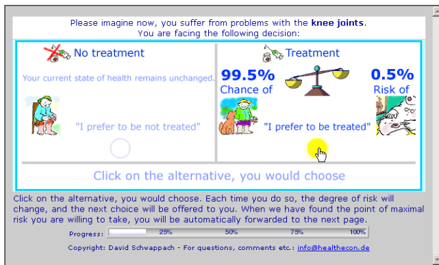
Figure 2 Screenshot of the standard gamble task (translated from the German original)

and avoiding the ping-pong procedure. If this was true, one would expect that the fraction of responders taking the easiest way to do so, namely "opting out" themselves by choosing the "indifference"-option, would increase with successive tasks. However, this was not the case. The number of responders ending a PTO task by clicking the "indifference"-option ranges between 35 (28%) and 46 (36%) per choice, and these figures are not correlated with the sequential placement of the respective PTO-choice among all 13 PTO-choices ( Spearman r = -0.09 , p = 0.8 ). Also, the number of successive bids per PTO-figure does not decrease with the sequential placement of the respective PTO-choice among the 4 resp. 5 PTO-choices of each PTO-task.