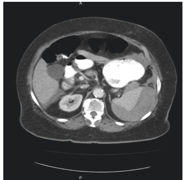
FIGURE 2: Axial CT scan section showing large subcapsular hematoma of the spleen with hemoperitoneum.

difficult colonoscopies, polypectomies, or biopsies were also not associated with a higher risk for injury to the spleen [8, 13]. Similarly, Singla et al. retrospectively reviewed over 102 cases of splenic injury occurring during colonoscopy reported in the literature over a 30-year period, and no association was observed between risk of splenic injury and the use of antiplatelet or anticoagulants, prior abdominal surgeries, and difficulty during colonoscopy [10].