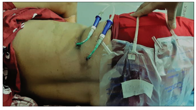
Figure 2: Two pigtail drains. One drain placed at the right pelvicalyceal system (percutaneous nephrostomy) and the other drain in the perinephric space to drain perinephric abscess

Ratio of male:female in our study was 1:4. In a similar study by Karthikeyan et al. , male: female ratio was 1:1.4.<sup>[11]</sup> Urinary tract obstruction has been reported to cause EPN in