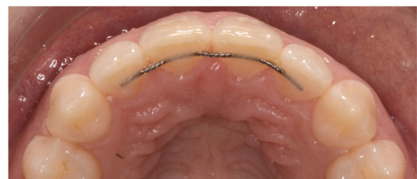
Fig. 4 .016" × .022" eight-strand braided SS wire (D-Rect., ORMCO) bonded to all four maxillary incisors at T_3

Descriptive statistics were calculated including baseline characteristics, type of first failure, distribution and number of failures per tooth type, and number of