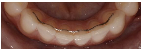
Fig. 2 .016" × .022" eight-strand braided SS wire (D-Rect., ORMCO) bonded to all 6 lower anterior teeth at T_3