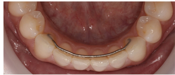
Fig. 3 .027" round TMA wire (ORMCO) bonded to lower canines only at T_3

(chipping within the composite—retainer still attached to the tooth but some composite necessary to recover the wire)