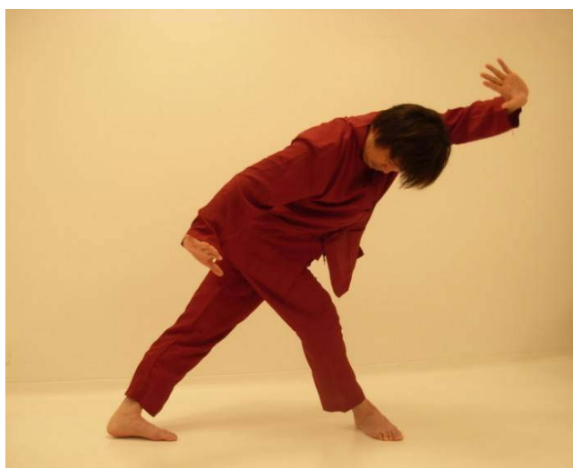
FIGURE 6. Lao qi gong: Instructor demonstrates a pose that should elicit a pandiculation-like response. Expansion of body dimensions and spontaneous motor action are features of pandiculation.

integrate body segments by inducing co-contraction of antagonist muscles (1) in a way that elicits a measurable rise in tonic muscle activity indicative of an overall increase in tensional load in the fascial system, which load increase is likely to unite bodily segments.