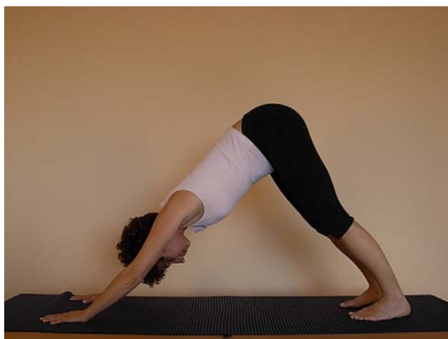
FIGURE 5. Downward Dog: As in pandiculation, the subject seeks maximum body dimensions and stretches soft tissues accordingly.

In any event, like the loading of pandiculation, the loading by MR of the myofascial system seems to