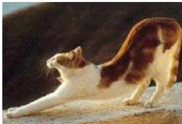
FIGURE 4. A pandiculating cat: In pandiculation, soft tissue spontaneously stretches to achieve maximum body dimensions. (From http://yawning.info , reproduced with permission).

In the author's personal experience, the practice of lao qi gong requires automatic (involuntary) tonus in the deep postural muscles while the superficial muscles associated with voluntary activity are