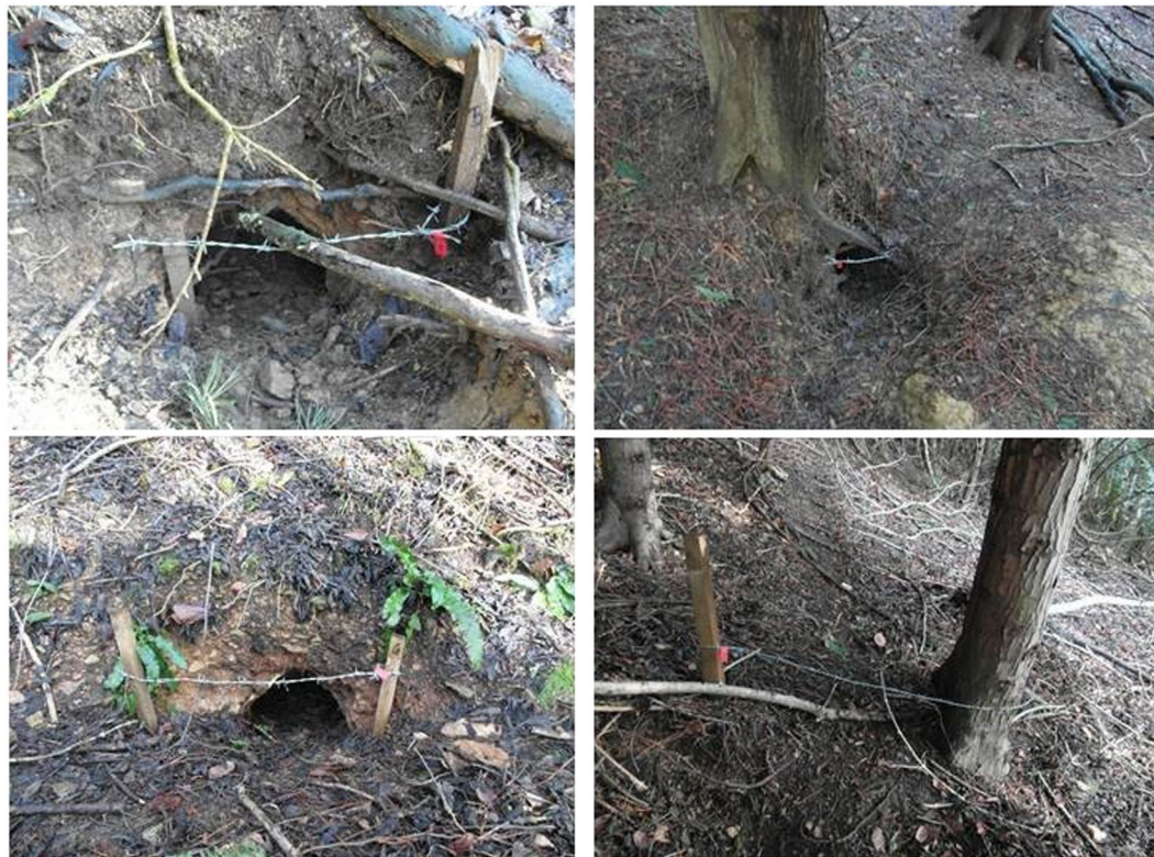
Figure 2. Examples of hair traps in situ over badger sett entrance holes and runs.

‘visiting’ the other. In the remaining two cases, the setts were determined not to be main setts because of the level of activity observed at the time of hair trapping and their distance to, and level of activity at, the nearest active sett. These reclassifications were attributed to changes in sett use between the original survey and when hair traps were deployed.