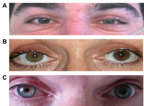
Figure 1 Photographs of the patients showing miosis, ptosis, and heterochromia iridum ( A , left eye; B, C , right eye).

post-traumatic dissection with left ICA congenital agenesis associated with left congenital Horner's syndrome.